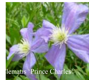
Clematis 'Prince Charles'