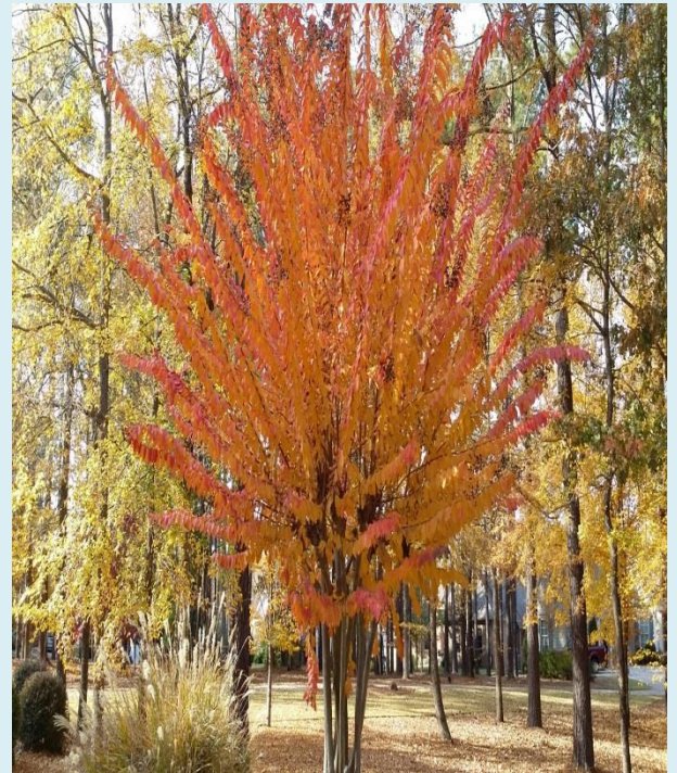
Colorful crepe myrtle.