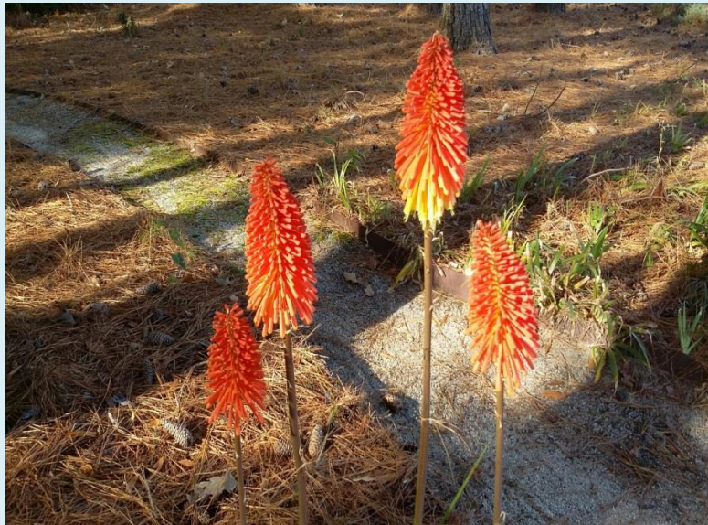
Winter-blooming Kniphofia rooperi.