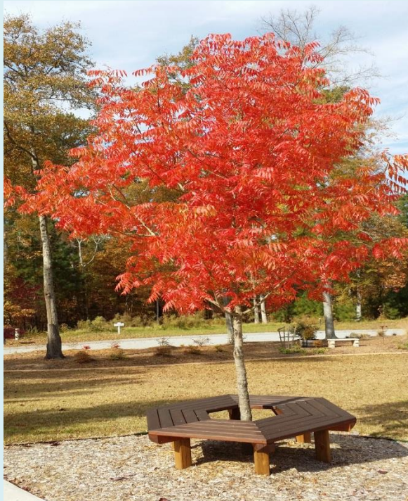
Bonnie Baumhofer's magnificent Chinese Pistache.