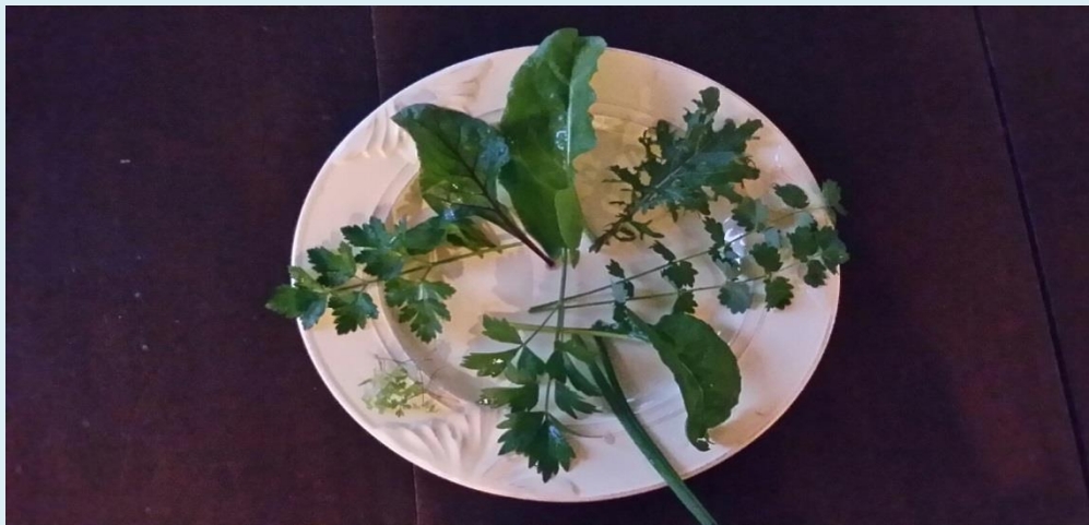
Clockwise from 12 o'clock: Sorrel, kale, salad burnet, chard, green onion, levesticum (lovage), Land cress, parsley, beet green