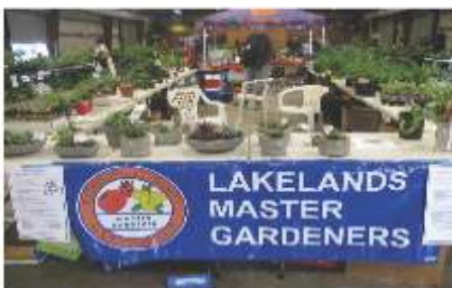
2012 Booth at the Farmers Market Building