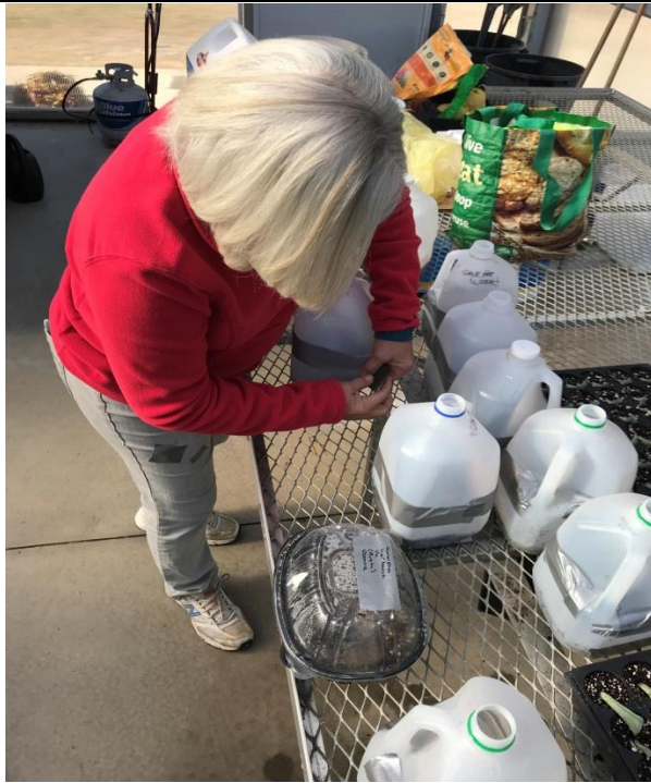
Wintersowing milk jugs are taped up for outside seed stratification.

JANUARY PUBLIC PANEL DISCUSSION "DON'T GET CAUGHT WITH YOUR PLANTS DOWN" was well attended and generated interest in next class.