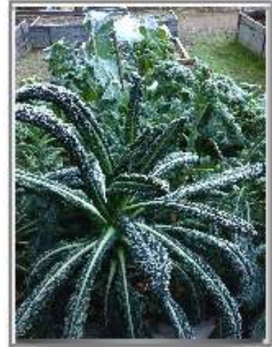
Frosty Kale-Better Flavor

(LMG General Membership Meeting at 6:00)