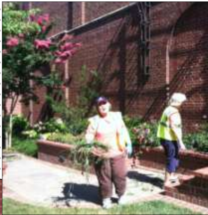
City Volunteer Program