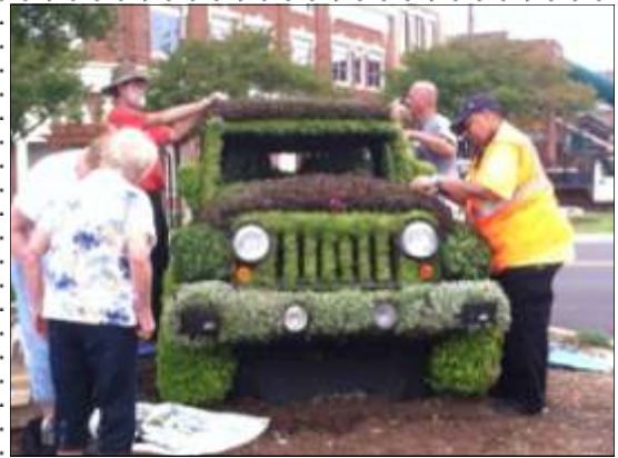
Jeep topiary trimming