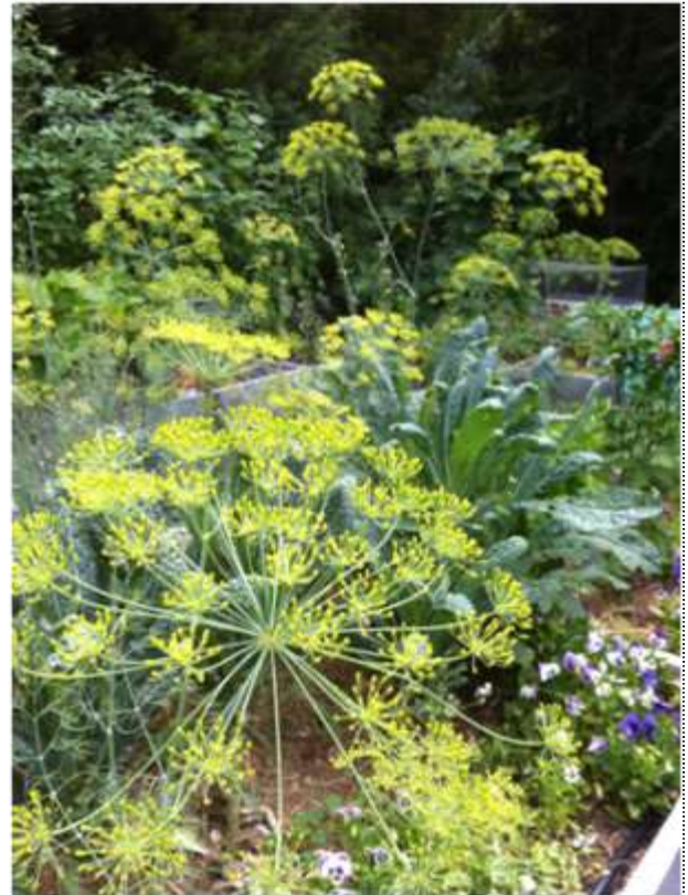
Towering Dill In My Garden Attracts Lacewing Who's Larvae Devours Aphids