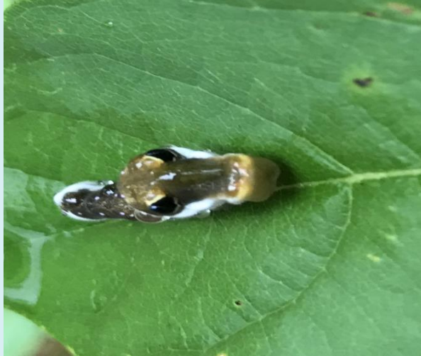
Deceptively "poopey" spicebush caterpillar on left.