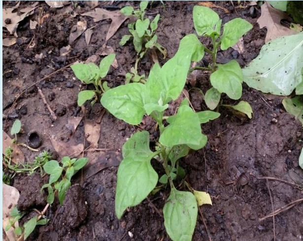
Triangular-leaf of New Zealand sun/wet- loving spinach.