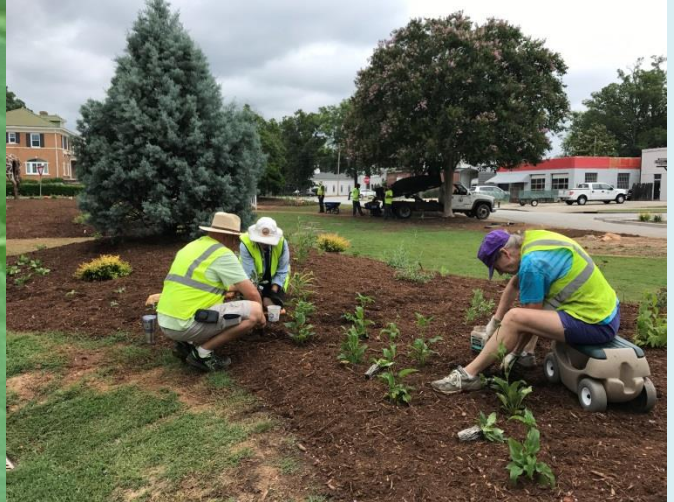
LMG'ers work to finish new garden for spicebush larvae.