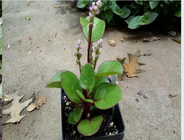
Round red-stemmed leaf of vining Malabar is shade tolerant.