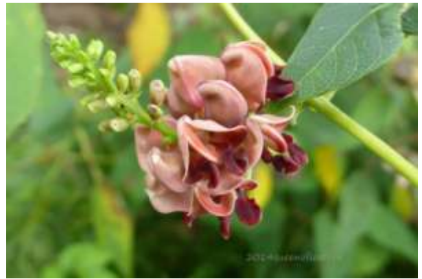
Plant 'B' - vine, blooms in late summer, compound leaves

Plant IDs can be made online at namethatplant.net