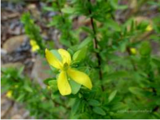
Plant 'A' - woody stems, blooms in August, simple leaf arrangement

See if you can ID the following wildflowers-