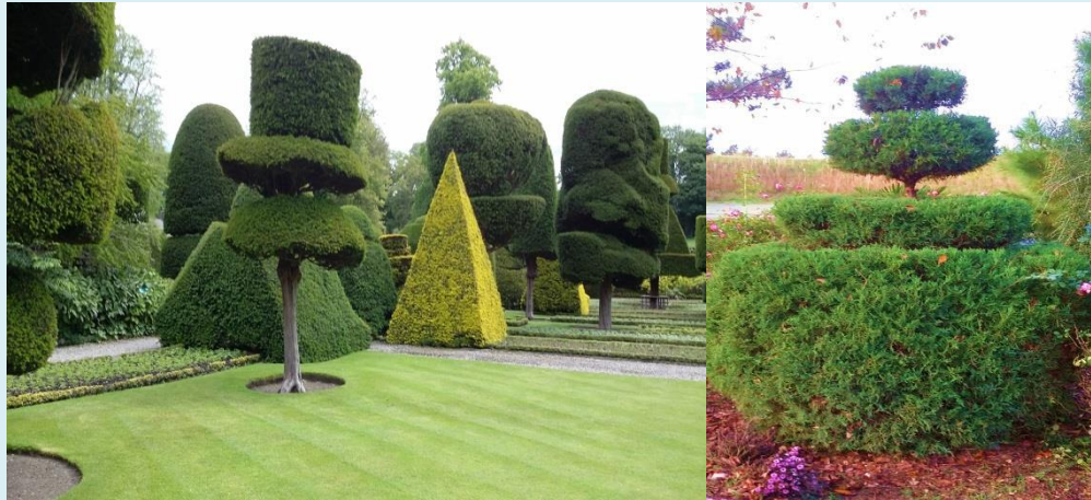
Levens Hall Tophat, 300 years old , 24 ft. tall