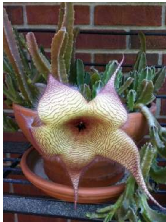
Starfish Flower Stapelia gigantea